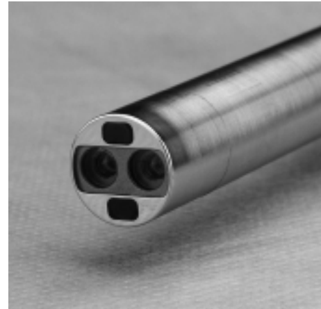
Figure 2. Two-channel endoscope with two cameras (resolution 75% higher than all the other three-dimensional video systems).

• true three-dimensional vision, thanks to a high-definition binocular optic system with a 10\times magnification, that guarantees a better view than the usual video-thoracoscopic view (Fig. 2);