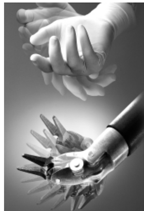
Figure 3. Endo-Wrist™ system.

• very fine movements of the tip of the endoscopic instruments (Endo-Wrist™, Mountain View, CA, USA) with 6 degrees of freedom, superior to the natural movements of the human hand and wrist. In fact the Endo-Wrist™ system can rotate up to 360^\circ while the human wrist can rotate only up to 180^\circ . The endoscopic arm has a fulcrum of rotation which is immobile at the level of the port for whatever position of the arm. This guarantees an atraumatic behavior for every movement. Although a complete tactile sensitivity is not yet available, the system prevents an excessive strength applied to the intrathoracic organs of the patients by inducing some resistance into the handles (Figs. 3 and 4). Also, the system autoregulates itself in case of collision between the instrumental arms to prevent damage to the system;