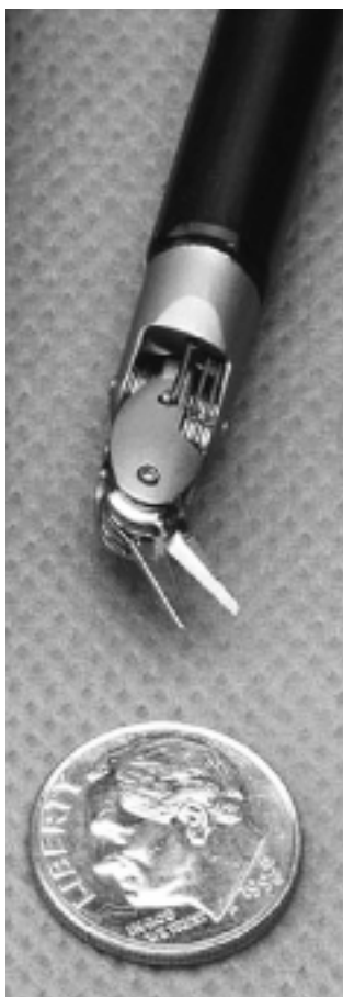
Figure 4. Instrument tip dimensions.