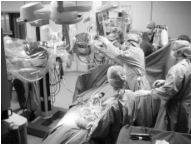
Figure 1. The slave unit approaching the operative table.