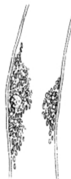
Figure 1. Two small mural thrombi which have formed within a small artery of the omentum of a guinea pig. The larger one contains, among blood platelets, a white blood corpuscle. This figure is reprinted from the original paper of Bizzozero 2 .

From a therapeutic point of view, the use of aspirin and other antiplatelet drugs